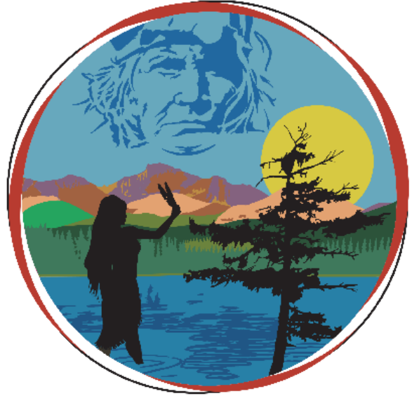
Nelson's original design in a vectorized format for use by the Dasiqox initiative