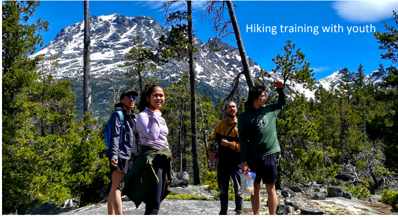
Hiking training with youth

Dasiqox-Nexwageʔan is an Indigenous Protected and Conserved Area (IPCA) located in Tsilhqot'in territory. Established in 2014, Dasiqox-Nexwageʔan is an expression of Indigenous governance in the shared caretaker area of Xeni Gwet'in and Yunesit'in, and is supported by the Tsilhqot'in National Government.