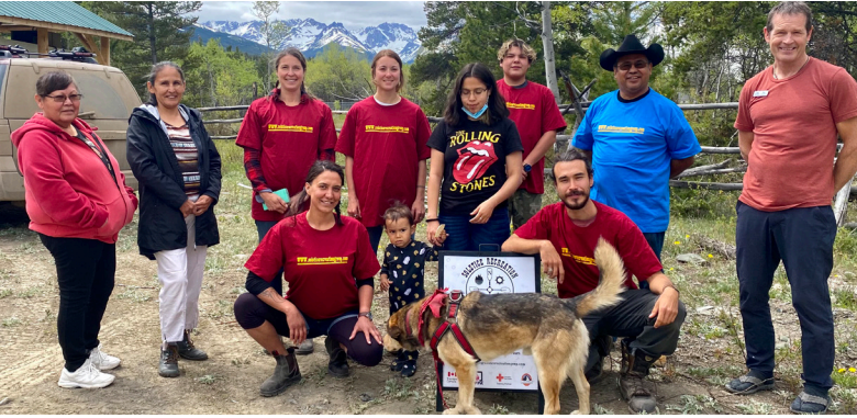
Some of the graduates of the First Aid Training at Xeni Gwet'in